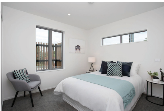
Sleep sound in your spacious bedroom