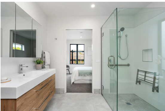
Fresh modern en-suite bathroom to pamper and relax in