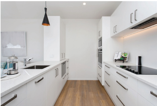
A full size kitchen with quality appliances