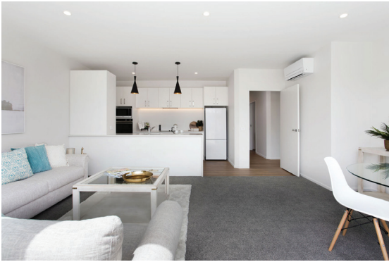
Open plan living, a delight for entertaining